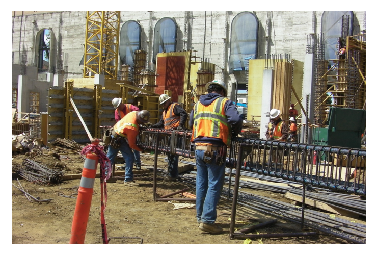
Instead of having ironworkers bend to tie rebar, the work is raised to their comfort zones.

A small wood processing plant spent $5,338 annually for ergonomic evaluations, new equipment, and a physical therapist to teach exercises about how to prevent musculoskeletal disorders. During three years of interventions, the company had no reports of acute low back pain. It also had a 10% gain in productivity and saved an estimated $76,872 a year, or $625 per worker.