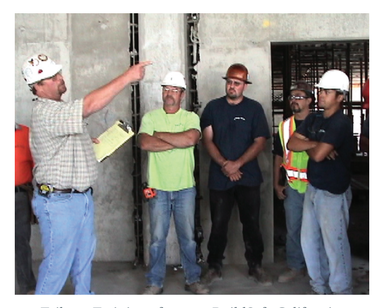
Tailgate Training of a crew, BuildSafe California.

In 2006, an industrial mining company provided NIOSH-developed age awareness training in a