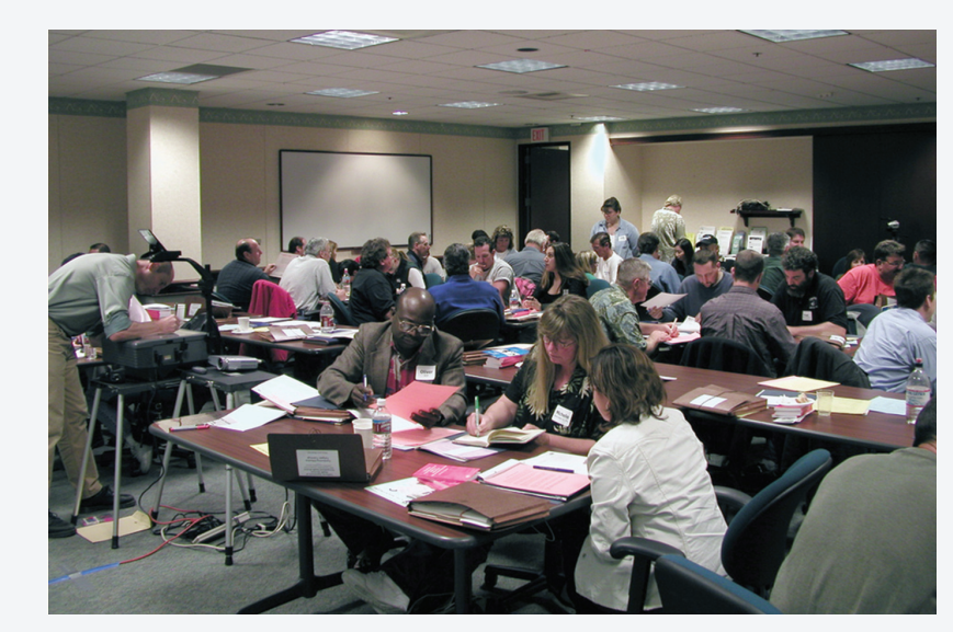
BuildSafe California training.

The Department of Public Health ran the fouryear project that involved stakeholders