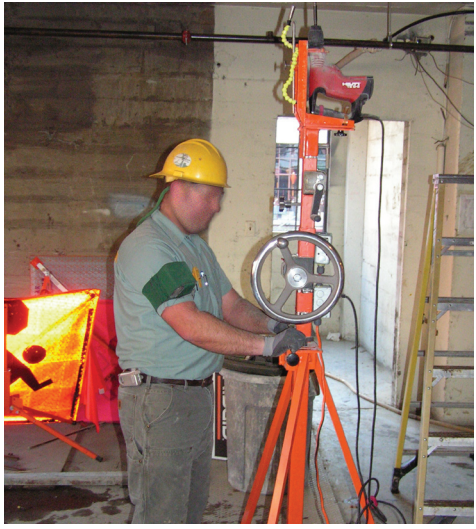
Overhead drilling before (left) and with new jig (right), UC Ergonomics Program.